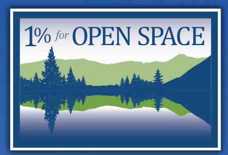
Saving Paradise Pennies at a Time

Printed on 100% recycled, FSC certified, chlorine free paper with vegetable-based ink.